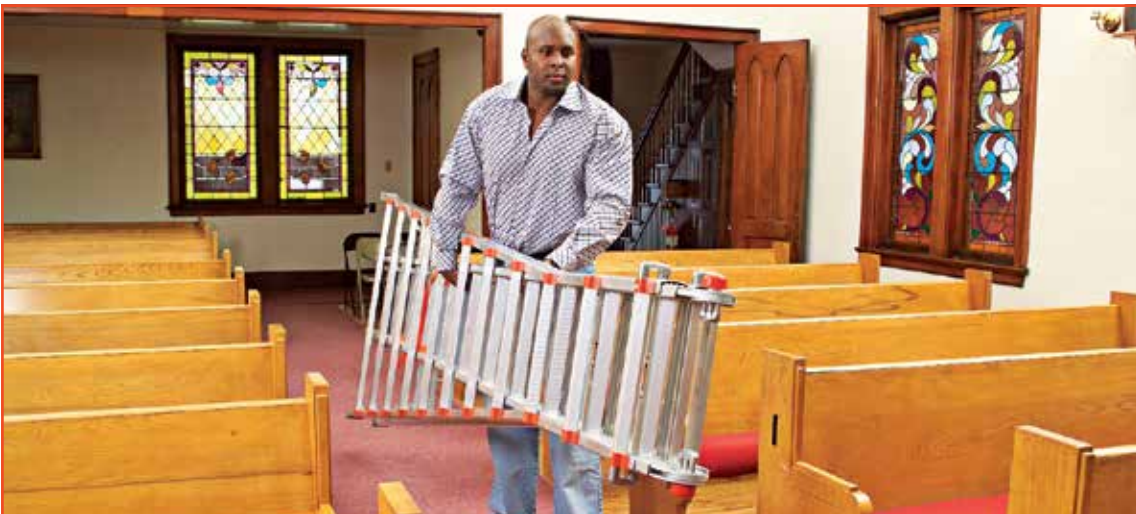
Goes places that other tall A-frame stepladders and power lifts cannot go