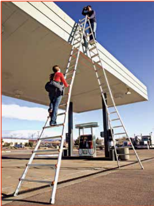
Save time and use safely as a true two-person stepladder