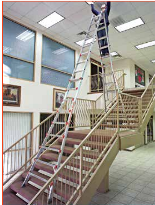
Safe and easy to use on stairs, stadium seating, stages, and other uneven surfaces